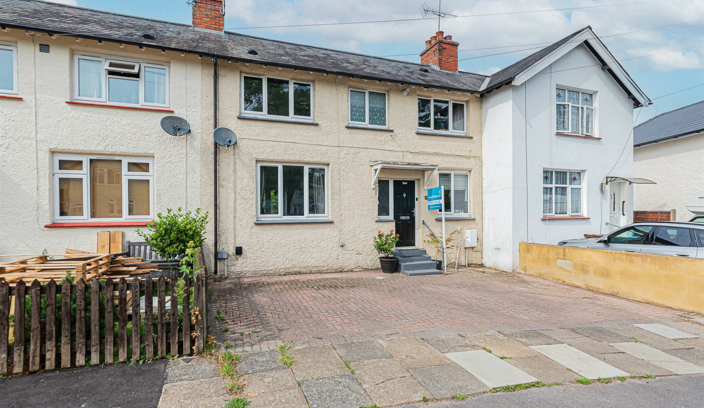
Chetwode Place, Aldershot